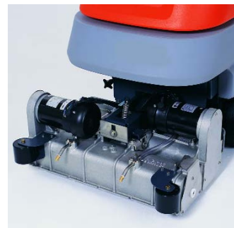
Phoenix 24 and 28